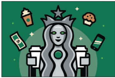
Artificial intelligence: The My Starbucks Barista uses artificial intelligence to create personalized customer experiences and manage real-time customer interactions, based on everything from customers’ past transactions and preferences to local traffic and weather conditions.

Hosts of retailers are employing AI to improve how they service and sell to their customers. For example, home improvement retailer Lowe’s is experimenting with LoweBots—five-foot something, fully mobile, AI-powered robots that roam stores helping customers. The LoweBots detect customers who might need assistance and engage them through voice and touchscreens. The AI robots tap store and external data to answer customer questions, offer solutions,